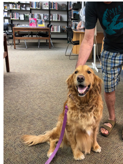
Therapy dog at the library spreading joy

The greatest work is shared work. When we gather together, and work towards a mutual goal, our common work and commonwealth is enhanced individually and collectively.